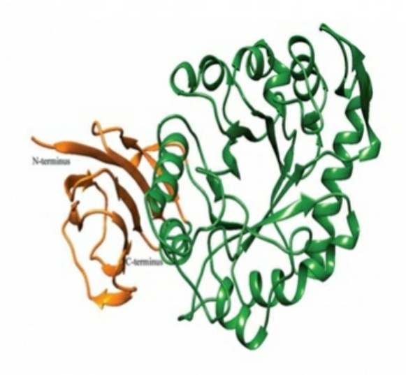
Crystal Structure of CtXyn30A