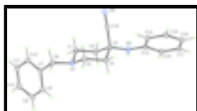
Fig. 1. Ellipsoids at the 50% level, with H atoms having arbitrary radius.