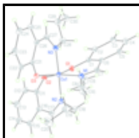
Fig. 1. The molecular structure of (I), drawn with 30% probability displacement ellipsoids for the non-hydrogen atoms.