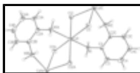
Fig. 1. A partial packing diagram of the title compound, with the displacement ellipsoids were drawn at the 30% probability level. [Symmetry codes: (A) I-x, -y, I-z ; (B) 1-x, -1/2+y, 1-z ; (C) +x, 1/2-y, +z .]