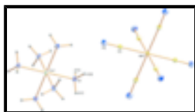
Fig. 1. An ellipsoid plot of the title compound (50% probability displacement ellipsoids).