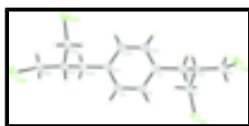
Fig. 1. The molecular structure of (I) showing the atom-labelling scheme and 30% probability displacement ellipsoids [symmetry code: (A) -x, -y + 2, -z + 1 ].