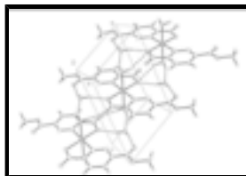
Fig. 2. Part of the crystal structure with hydrogen bonds shown as dashed lines.