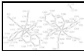
Fig. 1. Perspective drawing of the asymmetric unit with displacement ellipsoids drawn at the 50% probability level and hydrogen atoms removed.