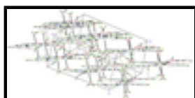
Fig. 2. A view of the two-dimensional supramolecular structure of (I) generated by \pi - \pi interactions.