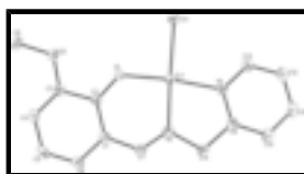
Fig. 1. View of (I) with the atom-labelling scheme. Displacement ellipsoids are drawn at the 30% probability level. All H-atoms were omitted for clarity.