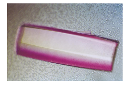
© 2005 International Union of Crystallography All rights reserved

Received 10 September 2004 Accepted 5 November 2004 Online 2 December 2004