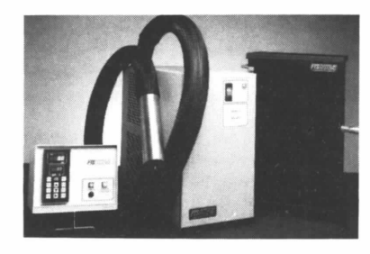
FTS Systems Air-Jet Crystal Cooler

The XR series of Air-Jet Crystal Coolers have been used by many researchers, especially in protein crystal work. The gas-stream technique provides a desirable means to temperature control samples in a manner that does not interfere with visual observation or physical measurements. They are also used for temperature control in NMR studies.