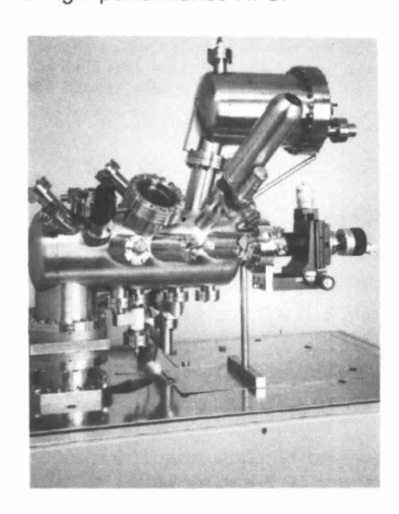
Combined UHV STM/XPS instrument from VG Microtech

been accepted by the user in Japan. The instrument will be used to study thin metal films deposited in an adjoining UHV system – the user is working to integrate the two systems over the next few months. The system is capable of atomic resolution imaging in the STM and high-performance XPS.