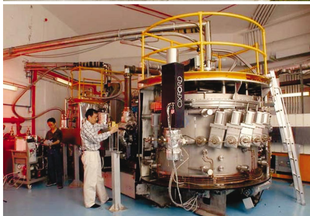
Top: SSLS building on the campus of the National University of Singapore. Bottom: Helios 2 storage ring inside the shielding vault.

SSLS is developing the general-purpose synchrotron light source capability of the compact superconducting storage ring Helios 2, which was manufactured by Oxford Instruments in close collaboration with Daresbury Laboratory in the early 1990s for the computer-chip-making industry. 700 MeV electrons orbiting through 4.5 T dipoles produce a very useful spectrum from about 10 keV to the far infrared. Several beamlines have come into routine operation and include the SINS (surface, nanostructures and interface science, see photograph top right) and the XDD (X-ray development and demonstration) beamlines. XDD has been used for example in demonstrating the high quality of K -edge XAFS of a thin Cu plate on Si. With photoemission spectroscopy, X-ray magnetic circular dichroism and X-ray absorption fine-structure spectroscopy from 50 eV to 1.2 keV, SINS is extensively used for thin-film and nanostructures characterization for such fields as magnetic data storage and self-assembly-based nanomanufacturing. Forthcoming in situ scanning tunneling and atomic force microscopy (STM/AFM) will enhance its competitive edge. Like all national synchrotron radiation