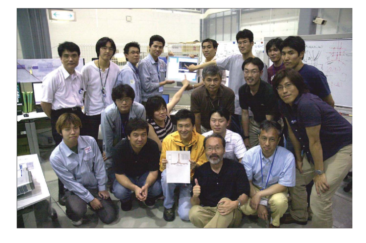
The Joint-Project Team on the day that lasing at 49 nm was achieved.