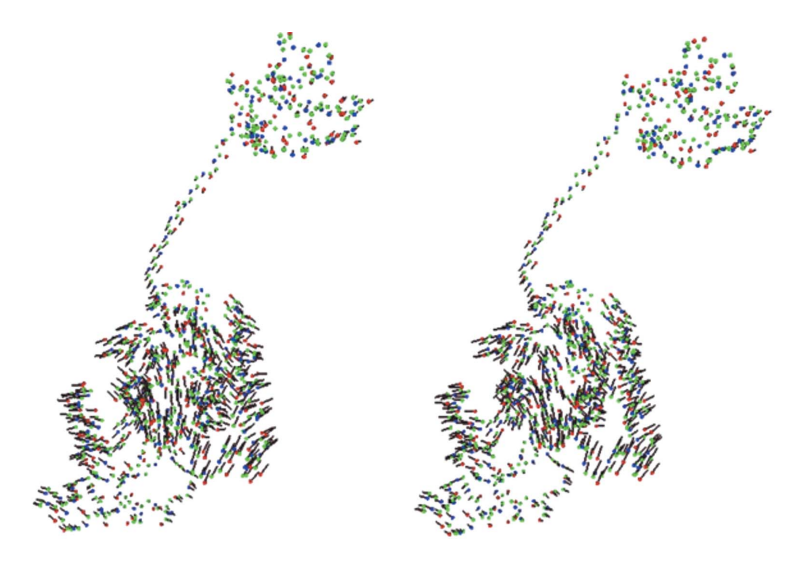
Figure 3 Stereoview of the molecular structure and the constraint force vectors for chitinase C. The SAXS-derived constraint force vectors are drawn as dark red lines. Only main-chain atoms are presented, and covalent bonds are omitted for simplicity. The catalytic domain and chitin-binding domain are located in the bottom-left and the top-right portions, respectively.