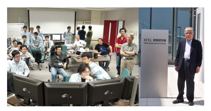
The SACLA team recording the moment at which it lased at 1.25 Å X-ray wavelength.

SACLA was designed to be composed of an 8 GeV linear accelerator of length 400 m and a 90 m-long undulator with 18 mm magnetic period. With additional space for user experiments, the total facility length is as short as 700 m, which is much more compact in comparison with LCLS and the European XFEL, which is currently being built in Hambury, Germany. Located on the same site as the 8 GeV SPring-8 synchrotron radiation facility, the SACLA linear accelerator will be used as a low-emittance electron beam injector to the SPring-8 storage ring, and both the SACLA XFEL beam and SPring-8 undulator X-rays can be guided onto the same sample to