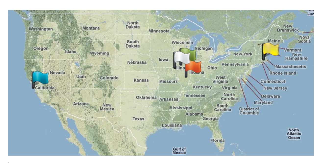
Figure 1 Geographic distribution of five endpoints participating in the trial of the prototype system. The flags represent, from left to right, Stanford Synchrotron Radiation Lightsource (blue, Stanford Linear Accelerator Center, Palo Alto, CA, USA), Fermi National Accelerator Laboratory (white, Batavia, IL, USA), Northeast Collaborative Access Team (green, Advanced Photon Source, Argonne, IL, USA), National Center for Supercomputing Applications (red, University of Illinois Urbana-Champaign, Champaign, IL, USA) and Harvard Medical School (yellow, Boston, MA, USA).

While systems exist to improve the high-level management of experimental data and the data's life-cycle (Moore et al. , 2006; Mattmann et al. , 2004; Flannery et al. , 2009), there are limited facilities for simple end-user access and management of federated data sets. The typical solution for beamline users is to transport an external hard drive with them to the facility and to copy files over USB or FireWire. The rapid increase in remote users is eliminating this option. Facilities generally hold user data for a period of weeks to months, but only as a temporary store until the user can repatriate their collected data at which point their institutional or laboratory