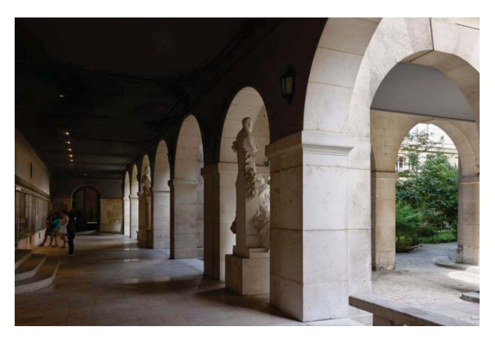
Campus des Cordeliers, Paris, France.

and industrial fields. Further details can be found at http://www.synchrotron-soleil.fr/Workshops/2013/IWORID2013.