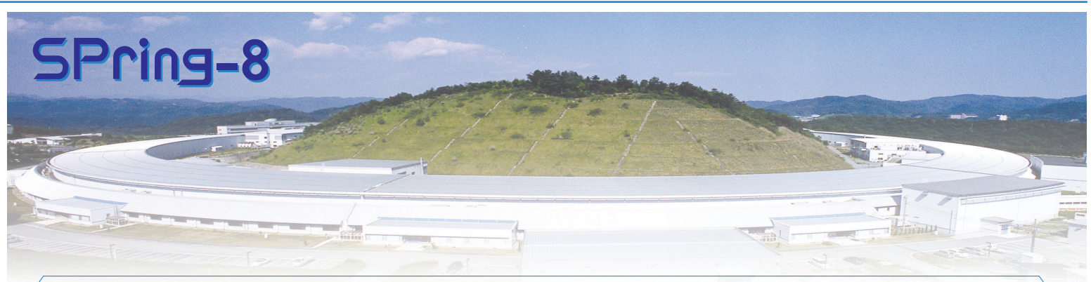
X-ray nano-tomography for obtaining deep understanding of Earth's interior

An X-ray nano-tomography system using a full-field x-ray microscope has been open to public users since 2006 at BL47XU in SPring-8. The system now has a spatial resolution of 200 nm (pixel size: \sim 75 nm/pixel) with a large-diameter Fresnel zone plate (310 µm) and a 110 µm field of view under typical conditions. The X-ray image detector has been changed from a CCD-based system to a high-definition sCMOS-based system to shorten the measurement time. As a result of these modifications, we have achieved a measurement time of 300 s for 900 projections. The X-ray energy can be selected between 6 and 10 keV to obtain high contrast for various samples.