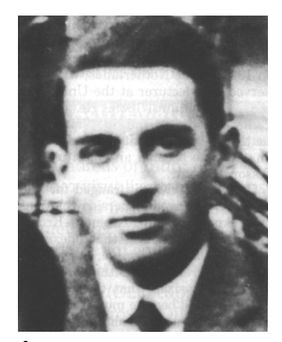
Figure 3 Ralph Kronig.

was simple to apply and interpret. Every experimenter found approximate agreement with the theory. There were always some absorption features close to that predicted by the possible lattice planes. However, the expected strong reflections [e.g. (100), (110), (111) etc.] did not always correlate with the most intense absorption features as intuitively expected. Still, agreement was close enough to be tantalizing and everyone tested the agreement of their measured 'Kronig structure' with the simple Kronig theory. In equation (2), energy positions W_n correspond to the zone boundaries, i.e. not the absorption maxima or minima, but the first rise in each fine-structure maximum. \alpha , \beta and \gamma are the Miller indices, a is the lattice constant and \theta is the angle between the electron direction and the reciprocal lattice direction. When averaged over all directions with a non-polarized X-ray beam and a polycrystalline absorber, \cos^2\theta = 1 . However, with a single-crystal absorber and polarized X-rays the absorption features should be larger for specific crystal planes. This was another experimental variable that might verify the theory and many attempted to test it. Thus began the long record of publications in which Kronig structure was interpreted in terms of the simple Kronig theory. Until the 1970s, fully 2% of the