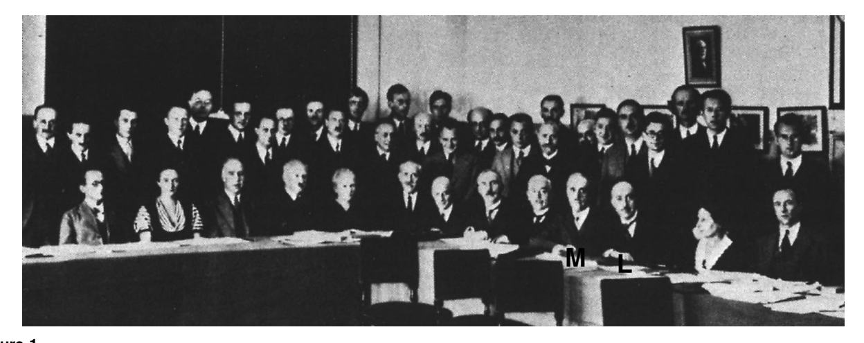
Figure 1 7th Solvay Conference; Maurice and Louis de Broglie identified by M and L.

Louis de Broglie's idea coupled with Schrödinger's wave equation spread like wildfire in the world of science. Everyone wanted to get into the act. Louis was invited to speak at the 5th Solvay conference in 1927 (Fig. 1). He was struggling with wave-particle dualism and had a halfformulated 'pilot wave' theory. The conference participants tore him apart. Most scientists were in favor of the probabilistic interpretation of the wave equation of Schrödinger. A few of the older scientists, Einstein and Lorentz among them, raised other objections. Also at the conference, the successful electron diffraction experiments of Davisson and Germer were announced. The discussion raged red hot and everyone that mattered had a loud opinion! This experience made a very great impression on Louis. The heated discussion and criticism of his ideas were taken personally. He could not forget it for the rest of his life and kept coming back to the problem of wave-particle dualism (de Broglie, 1960), trying to reconcile his initial insight with the demands of the quantum world and to state his ideas in a form acceptable to the world of physics. He