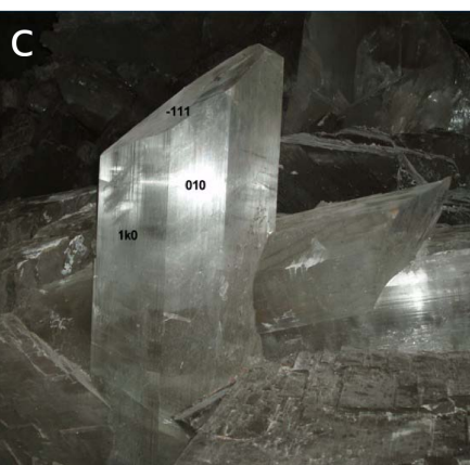
Figure 1. The two gypsum habits present in the Cave of Crystals at Naica. 10 meters long beam (a) showing the reentrant twin angle; sketch of the twin (b); 0.8 meters blocky crystal close to the equilibrium habit of gypsum (c).

Keywords: gypsum, twinning, growth mechanisms