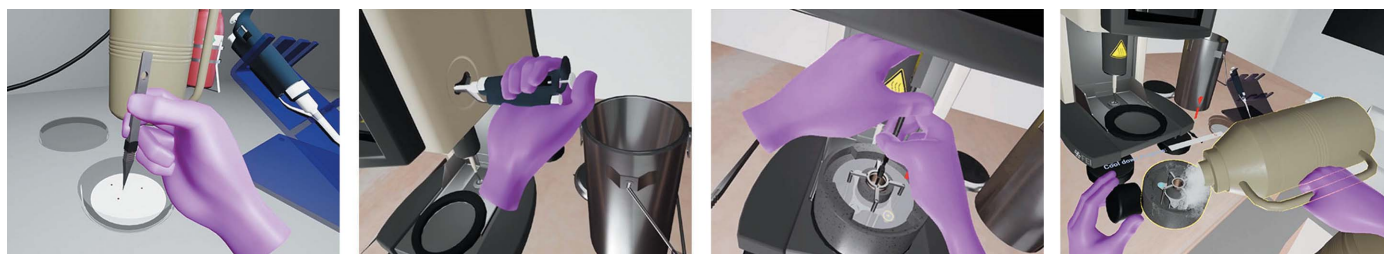
Figure 5 Different hand gestures tailored to operations for different virtual objects in CryoVR .

In March 2022, the National Center of CryoEM Access and Training (NCCAT) held a two-day workshop on cryoEM operation. 16 biological researchers participated in the workshop. We were invited to demonstrate CryoVR in the workshop. We invited these 16 participants to experience the four single-particle cryoEM VR training modules. We then interviewed and collected their opinions about CryoVR . These questions are from the IGROUP questionnaire template. Participants gave very positive feedback (Table 1). The results show the fact that users are actively engaged in operating cryoEM devices in the virtual environment (Q3, 4.5). They feel the devices are realistic (Q1, 3.89) and feel presence in a cryoEM laboratory (Q2, 3.56). The instructions shown in the VR scenes are clear and effective. They agree that CryoVR is an effective training tool (Q4, 4.03; Q5, 4.56), are willing to use