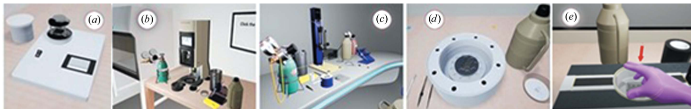
Figure 2 CryoVR modules. (a) Grid Glow Discharging (easiGlow); (b, c) Plunge Freezing with TFS Vitrobot Mark IV (b) and Gatan CP3 (c); (d) TFS AutoGrid Clipping; (e) TFS AutoGrid Loading.

collection and potentially less damage and downtime of the instruments caused by ‘rookie’ errors. Of course, the final certification by the trainer for independent operation of the physical instruments will continue to be performed on the physical instruments. Considering the strengths and limitations of VR training, we set the following learning objectives for CryoVR .