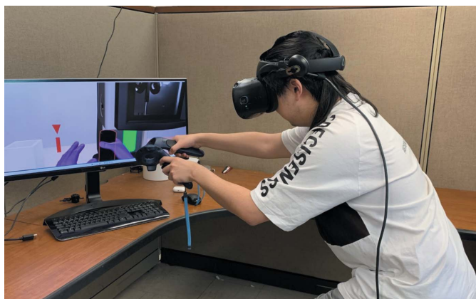
Figure 4 A user performing virtual plunge-freezing in CryoVR with an HTC Vive device.

Presence and realism are key factors that determine whether a user can have a satisfactory experience in a virtual environment and are vital to the success of VR training (Hays & Singer, 1989; Bowman & McMahan, 2007). Realistic surroundings and interactions with virtual objects are especially important elements when designing VR applications for higher education (Radianti et al. , 2020). 'Immersion' and 'presence' objectively measure a simulation environment. There are many key factors related to hardware, for example, a wide field of view, short reaction latency and high display resolution and refresh rate (Bowman & McMahan, 2007; Hoffman et al. , 2006; Meehan et al. , 2003; McMahan et al. , 2012). Researchers and hardware manufacturers have devoted huge efforts to improving VR devices and have made consumer-level VR headsets and controllers suitable for simulating daily physical activities (Borges et al. , 2018; Desai et al.