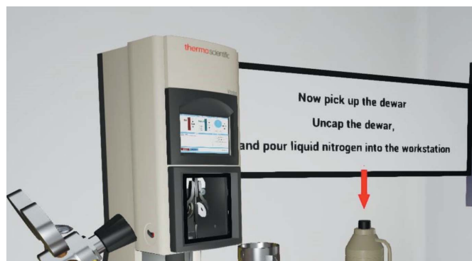
Figure 3 Tutorial mode of the Vitrobot training module in CryoVR . Voice, text/visual user interface and video instructions guide the user to learn the experimental procedures.

4.2.2. Exam mode. We aim at conferring the users of CryoVR modules with sufficient skills necessary for the use of the instruments and their operational procedures to reduce the time needed for their final on-site training on physical instruments. To assess learning outcomes, a final examination will be critical to evaluate user skills. In our survey, a majority of respondents (74.3%) considered the CryoVR Exam mode