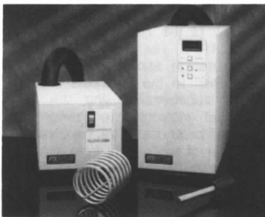
The FC55 cold probe

The new FC55 immersion cooler generates temperatures down to -55^{\circ}\text{C} using non-CFC refrigerant gas in a reliable mechanical refrigeration system. The FC55 can be used in place of dry ice or liquid nitrogen as a cooling source for liquid baths or as a cold trapping surface to trap solvents or other condensates from vapor streams. The FC55 generates cooling power of more than 230\text{ BTU h}^{-1} at -40^{\circ}\text{C} and has a footprint of only 10.5 in wide \times 16.5 in deep.