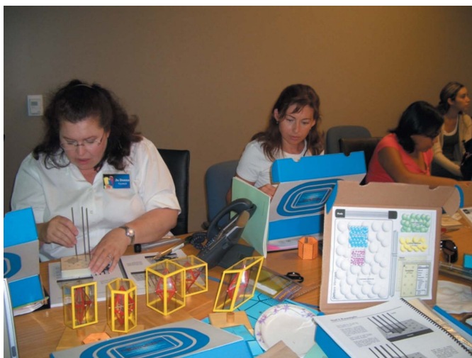
Figure 6 'Mysteries of Water.' Secondary chemistry and biology teachers participate in the NSF-sponsored 'Mysteries of Water' workshop, held at the University of California Irvine in 2006.

By harnessing the power of end-to-end cyberinfrastructure and building on existing programs and expertise, CAL-PRISSM is providing students, college/university faculty and secondary classrooms with real-time remote access and control of specialized scientific instruments from remote locations, together with real-time discourse. CAL-PRISSM aims to promote cross-disciplinary collaboration between researchers using these technologies, and to improve educa-