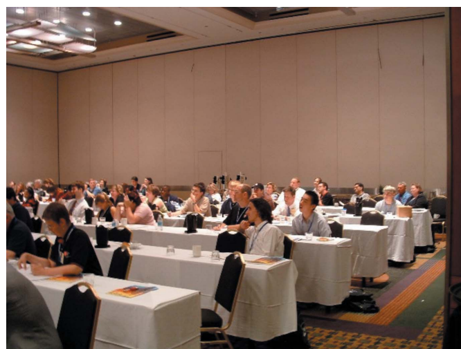
Figure 5 'X-rays, Crystals, Molecules, and YOU!' Teachers and students participate in the 'X-rays, Crystals, Molecules, and YOU!' ACA workshop, 2004.