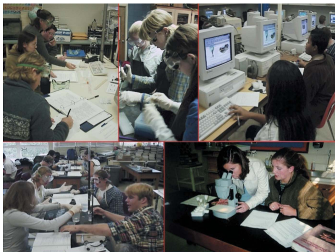
Figure 3 Highlights of the structural biology workshop emphasizing protein crystal growth in microgravity. Instructors are working with students in showing how proteins are prepared, crystallized and subsequently analyzed by X-ray diffraction.

Along the same line, space-grown crystals have less incorporation of large impurities. Many impurities are combinations of protein molecules that are amorphous or denatured. These are often two–three times larger than protein molecules and as a result diffuse much more slowly. The slower diffusion time thus reduces the chance of their incorporation onto the surface of the crystal, which may impede its growth. Under