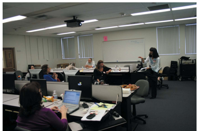
Figure 7 CAL-PRISSM. Secondary biology, chemistry, earth science and physics teachers work with university faculty to develop teaching materials for the high school curriculum that incorporate remote-enabled instruments and conform to California Science Content Standards.