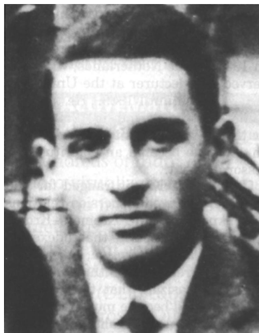
Figure 3 Ralph Kronig.

was simple to apply and interpret. Every experimenter found approximate agreement with the theory. There were always some absorption features close to that predicted by the possible lattice planes. However, the expected strong reflections [ e.g. (100), (110), (111) etc. ] did not always correlate with the most intense absorption features as intuitively expected. Still, agreement was close enough to be tantalizing and everyone tested the agreement of their measured 'Kronig structure' with the simple Kronig theory. In equation (2), energy positions W_n correspond to the zone boundaries, i.e. not the absorption maxima or minima, but the first rise in each fine-structure maximum. \alpha , \beta and \gamma are the Miller indices, a is the lattice constant and \theta is the angle between the electron direction and the reciprocal lattice direction. When averaged over all directions with a non-polarized X-ray beam and a polycrystalline absorber, \cos^2 \theta = 1 . However, with a single-crystal absorber and polarized X-rays the absorption features should be larger for specific crystal planes. This was another experimental variable that might verify the theory and many attempted to test it. Thus began the long record of publications in which Kronig structure was interpreted in terms of the simple Kronig theory. Until the 1970s, fully 2% of the