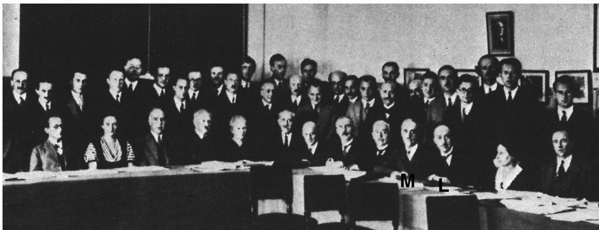
Figure 1 7th Solvay Conference; Maurice and Louis de Broglie identified by M and L.

Louis de Broglie's idea coupled with Schrödinger's wave equation spread like wildfire in the world of science. Everyone wanted to get into the act. Louis was invited to speak at the 5th Solvay conference in 1927 (Fig. 1). He was struggling with wave-particle dualism and had a half-formulated ‘pilot wave’ theory. The conference participants tore him apart. Most scientists were in favor of the probabilistic interpretation of the wave equation of Schrödinger. A few of the older scientists, Einstein and Lorentz among them, raised other objections. Also at the conference, the successful electron diffraction experiments of Davisson and Germer were announced. The discussion raged red hot and everyone that mattered had a loud opinion! This experience made a very great impression on Louis. The heated discussion and criticism of his ideas were taken personally. He could not forget it for the rest of his life and kept coming back to the problem of wave-particle dualism (de Broglie, 1960), trying to reconcile his initial insight with the demands of the quantum world and to state his ideas in a form acceptable to the world of physics. He