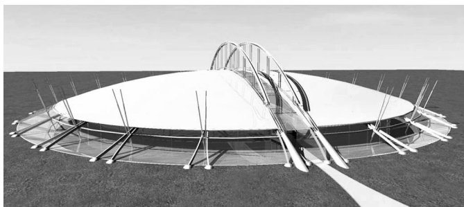
An impression of the new Australian synchrotron.

The design parameters are not yet fully defined but it is expected that the storage ring will have a machine energy of 3 GeV. It is going to be about 57 m in diameter with a beam emittance of around 12 nm rad.