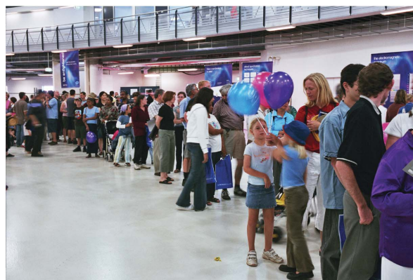
Open day at the Australian synchrotron.