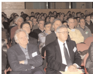
The Users' Meeting.

The ESRF annual Users' Meeting and its satellite workshops brought together more than 400 users on 5-7 February at the European Light Source. The meeting focused on the latest developments and challenges of the Upgrade Programme and it included two workshops on time-resolved and in-situ catalyst research with X-rays and on structural and molecular biology of host-pathogen interactions.