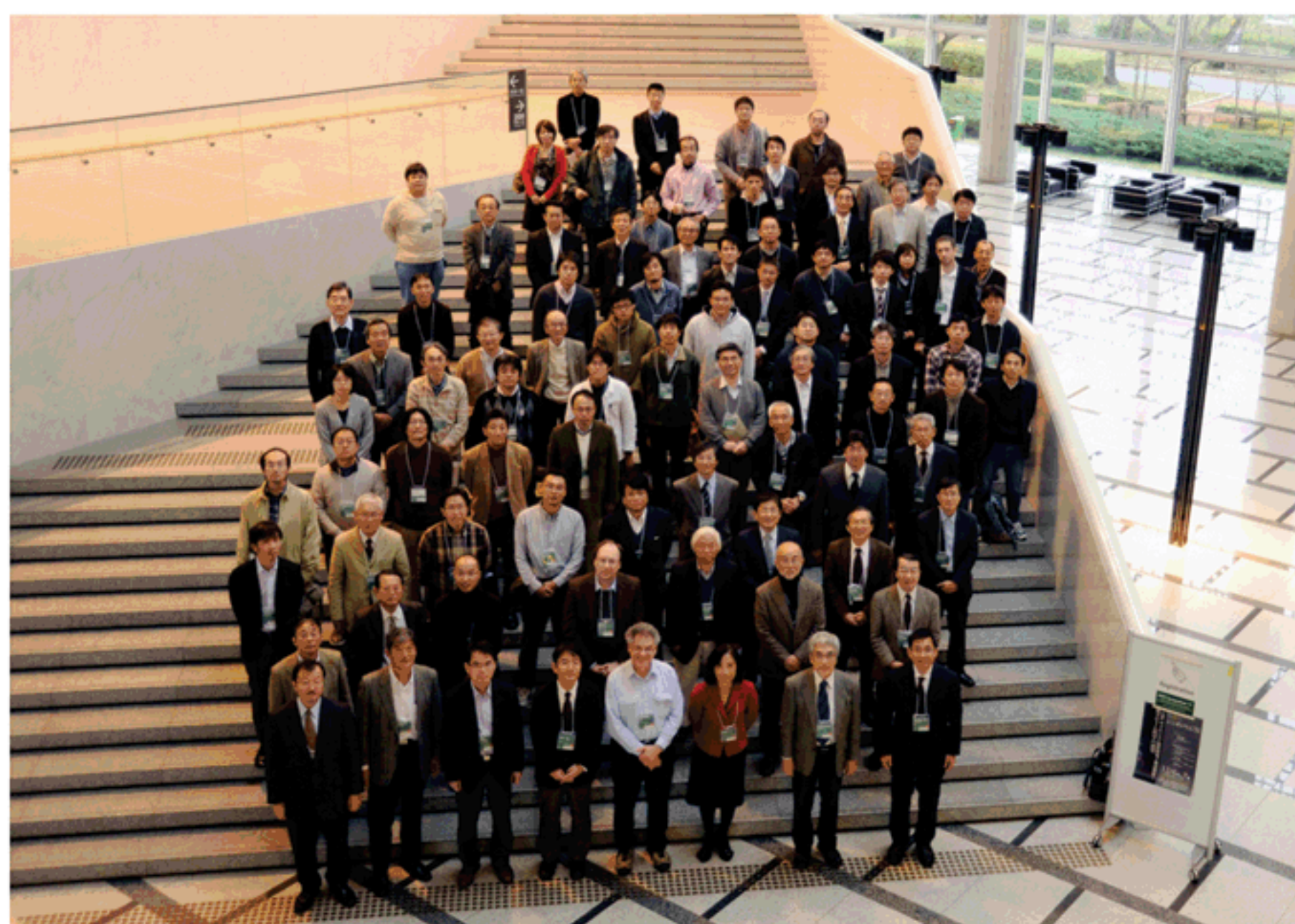
Group photo of all the participants.